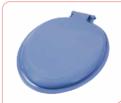
SOLID EWC SC - 3 SOLID EWC JET SC - 4