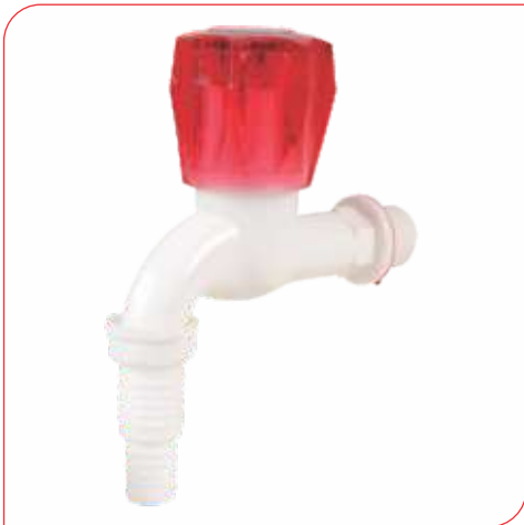
CRYSTAL NOZZEL SHORT BC - 7 CRYSTAL NOZZEL LONG BC - 8