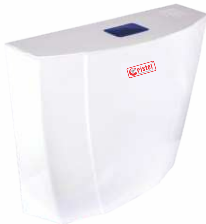
SINGLE PUSH FLUSH TANK FT - 3