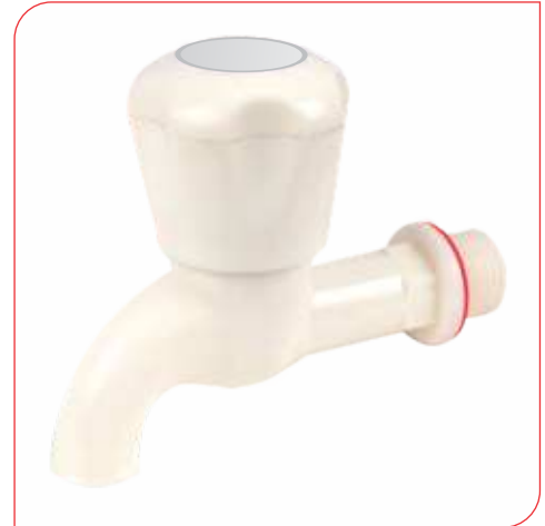
MARVEL SHORT BC - 17 MARVEL LONG BC - 18