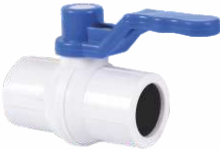
PP-PVC LONG HANDEL BV - 31 TO 40