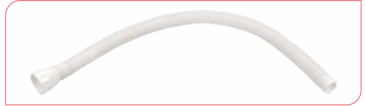
FLEXIBLE WASTE PIPE 2.5 FT WP - 3 FLEXIBLE WASTE PIPE 3.0 FT WP - 4