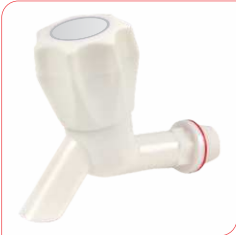
POLO SHORT BC - 13 POLO LONG BC - 14