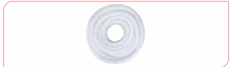
FLEXIBLE WASTE PIPE ROLL (30 MTR) WP-9