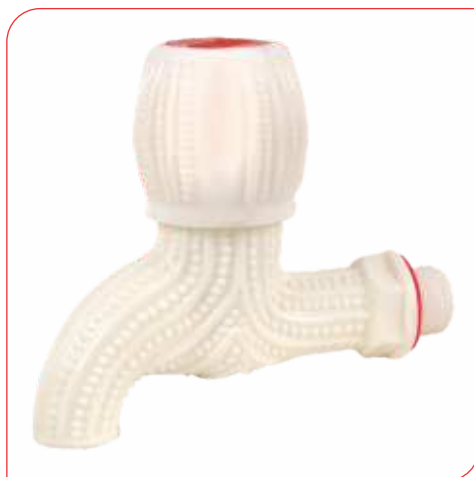
ZEBRA SHORT BC - 24 ZEBRA LONG BC - 25