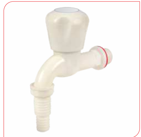
MARVEL NOZZEL SHORT BC - 22 MARVEL NOZZEL LONG BC - 23