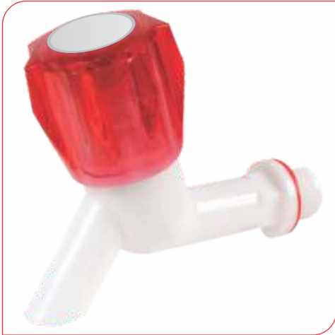
CRYSTAL POLO SHORT BC - 1 CRYSTAL POLO LONG BC - 2