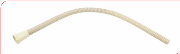
SPRING WASTE PIPE 2.5 FT WP - 5 SPRING WASTE PIPE 3.0 FT WP - 6