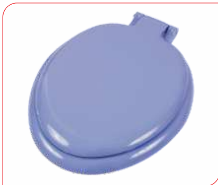
SUPER EWC SC - 1 SUPER EWC JET SC - 2