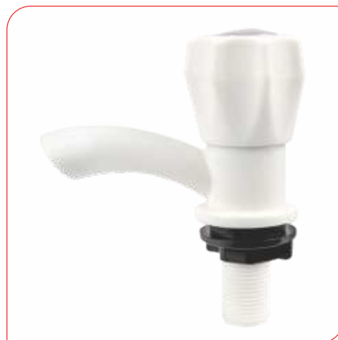
PILLAR COCK BC - 26