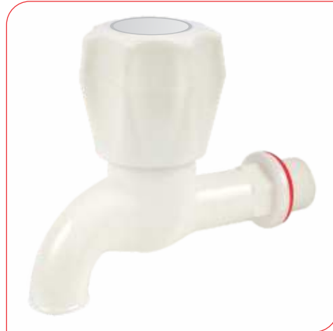
SUPER SHORT BC - 15 SUPER LONG BC - 16