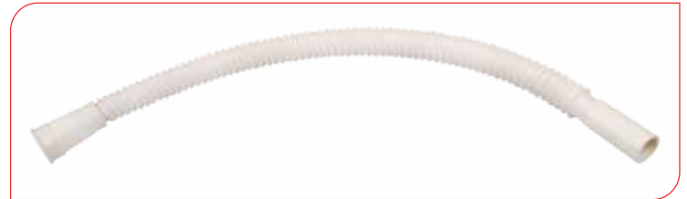
MAGIC (ULTRA MODERN) WASTE PIPE WP-7