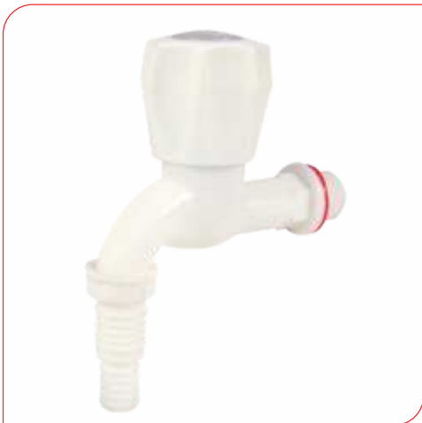
NOZZEL SHORT BC - 19 NOZZEL LONG BC - 20