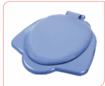
ANGLO INDIAN SC - 5 ANGLO INDIAN JET SC - 6