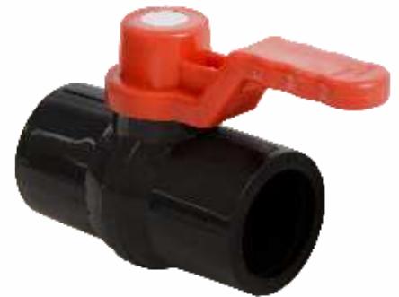
PVC LONG HANDEL (BLACK) BV - 51 TO 60