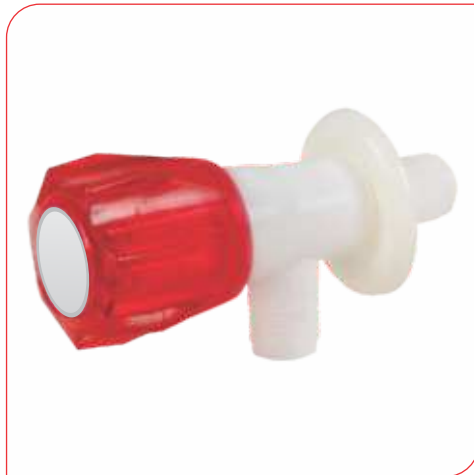
CRYSTAL ANGEL BC - 9