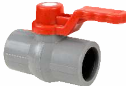
PVC LONG HANDEL (GREY) BV - 71 TO 80