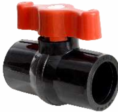
PVC (BLACK) BV - 41 TO 50