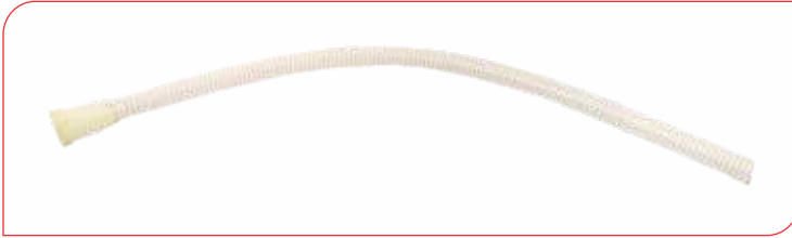
SUPERFLOW WASTE PIPE 2.5 FT WP - 1 SUPERFLOW WASTE PIPE 3.0 FT WP - 2