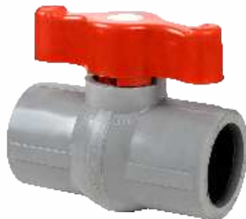
PVC (GREY) BV - 61 TO 70