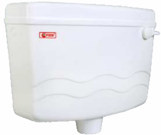
SIDE HANDLE FLUSH TANK FT - 2