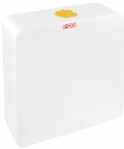
DUAL FLUSH TANK FT - 1