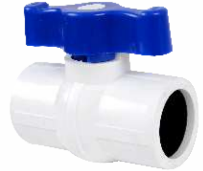
PP-PVC BV - 21 TO 30