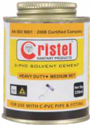
CPVC SOLVENT CEMENT CSC 1 TO 5