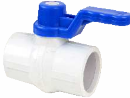
PP-UPVC LONG HANDEL BV - 11 TO 20