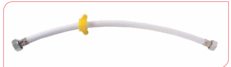
CONNECTION PIPE WITH KEY CP - 17 TO 24 HEAVY CONNECTION PIPE WITH KEY CP - 25 TO 32