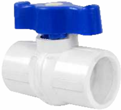
PP-UPVC BV - 1 TO 10