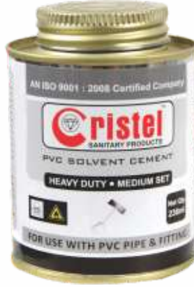
PVC SOLVENT CEMENT PSC 1 TO 5