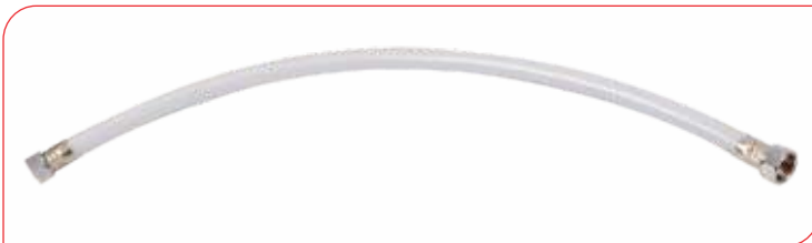
CONNECTION PIPE CP - 1 TO 8 HEAVY CONNECTION PIPE CP - 9 TO 16