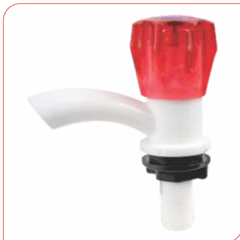
CRYSTAL PILLAR COCK BC - 12