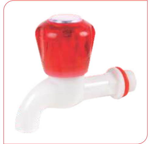
CRYSTAL MARVEL SHORT BC - 5 CRYSTAL MARVEL LONG BC - 6