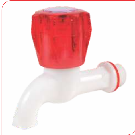
CRYSTAL SUPER SHORT BC - 3 CRYSTAL SUPER LONG BC - 4