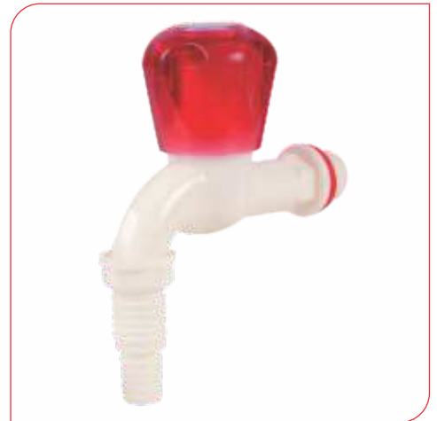
CRYSTAL NOZZ. MARVEL SHORT BC - 10 CRYSTAL NOZZ. MARVEL LONG BC - 11