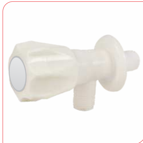
ANGEL COCK BC - 21