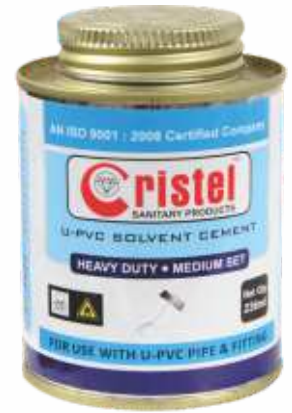
UPVC SOLVENT CEMENT USC 1 TO 5